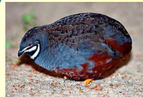
שָׁלוּ (Quail) Coturnix coturnix

רַב חֲנִינְיָ בַר רָבָא says that there are four types of שָׁלוּ birds (see side) and the one that the Israelites received, the שָׁלוּ bird itself, is the worst of them all! (The שִׁיבְלִי bird is the best).