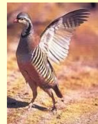
שִׁיבְלִי (Rock Partridge) Alectoris graeca