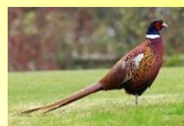
פְּסִיּוֹנִי (Pheasant) Phasianinae