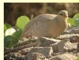
קִיבְלִי (Sand Partridge) Ammoperdix heyi