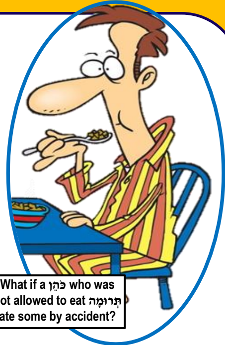
What if a כהן who was not allowed to eat תרומה ate some by accident?

רבי יהושע says that he does not have to pay anything back. Since he thought he was performing the מצוה (commandment) of eating holy food, he does not have to be punished.