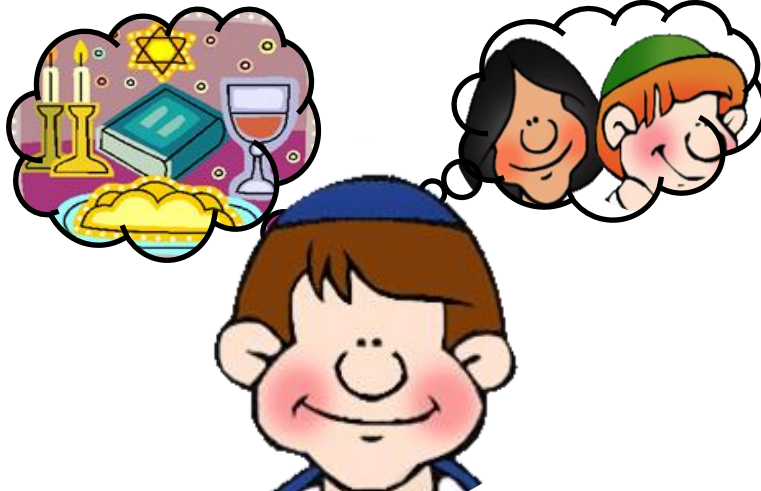
One must fear one's parents and keep the Sabbath

We all know that we should listen to our parents. But what if your parents tell you to do something you know is wrong? Or what if they tell you to do something Hashem told you not to do?