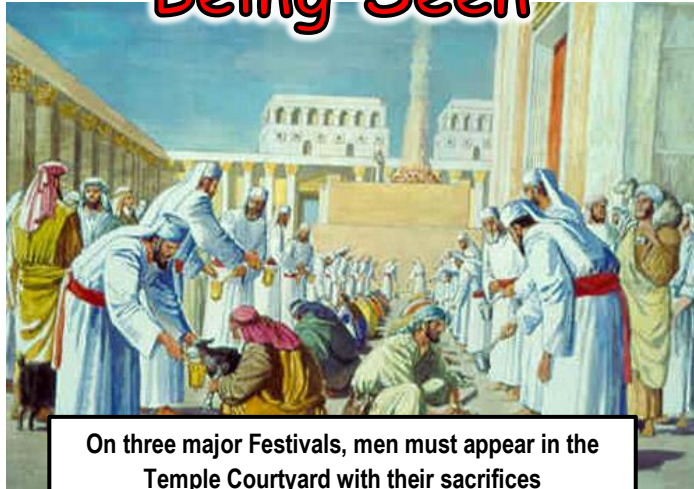
On three major Festivals, men must appear in the Temple Courtyard with their sacrifices

Jewish men are commanded to go up to the בֵּית הַמִּקְדָּשׁ (Holy Temple) in Jerusalem on פֶּסַח (Passover), שְׁבוּעוֹת (Festival of Weeks) and סוּכּוֹת (Festival of Booths).