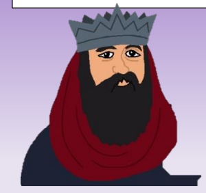
אַרָּכְּה – Blessing

On שְׁמִינִי עֲצֶרֶת the people would bless the king. This was in memory of the dedication of the בית הַמְקְדָשׁ (Holy Temple) when the Jewish People blessed שְׁלמֹה on the eighth day.