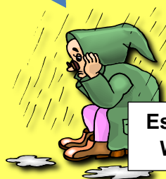
Escape the Weather