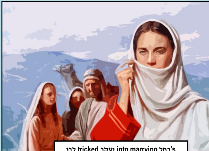
לבן tricked יעקב into marrying רחל's sister...and רחל let it happen!

At this point, יעקב knew that לבן might try to trick him into marrying רחל's sister. He devised a plan. יעקב made up signs and taught them to רחל. That way, יעקב would be